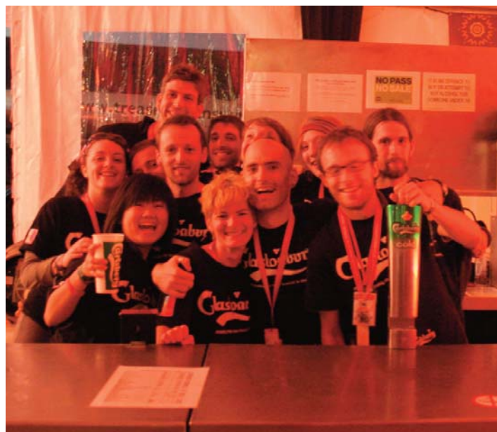
Volunteers raising money for Anti-Slavery International at Glastonbury